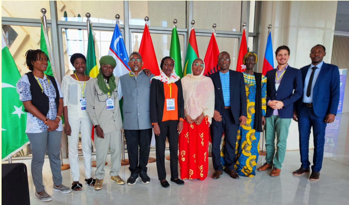
GFOD's delegation to the 79th ordinary session of African Commission on Human and People's Rights